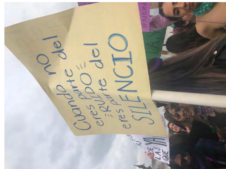
"When you are not part of the noise you are part of the silence."

No matter how hard she tried she couldn't ease the willow's tears and, finding herself at the end of her tether, she left for a place too far and too beyond - a place where the map runs out. A place where the savages roam, a place for her to belong. There in the middle of the desert she came upon a blessed oasis. In the middle of this oasis grew a rose bush sprinkled with roses of a million hues. She picked a rose with utmost care. On returning home, she gave her treasure to the weeping willow, who took the rose and rose above its sorrow.